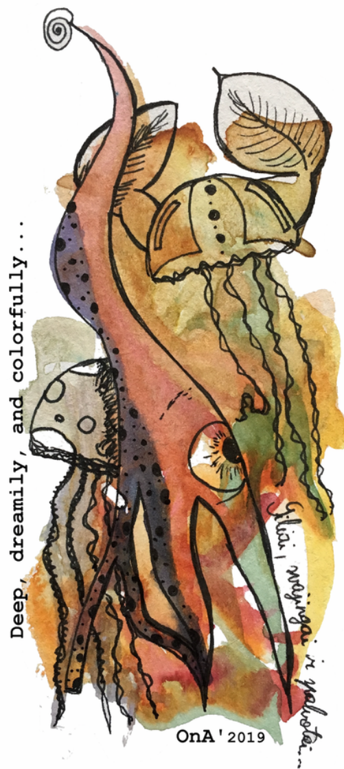
A watercolor by Ona in 2019.

Watercolor is another major activity I do almost every day. I started when my grandmother enrolled in an art school and showed me ways to spread watercolors, sprinkle salt on the surface, and then let my imagination roam free. I've become so used to looking at random blobs of color and visualizing what they could turn into that now even the scanning electron microscope (SEM) images of synthesized materials become like SciArt canvases to me. One other activity I love is having discussions and tons of laughs with everyone in the Kempa Lab. It brings me as much joy as being in the family I grew up with and love dearly. It is an incredible collection of scientists who make both - science and life - as enjoyable as they can get. No wonder our lab's most recent Ph.D. graduates all pointed out that it is the best lab in the world to be part of!