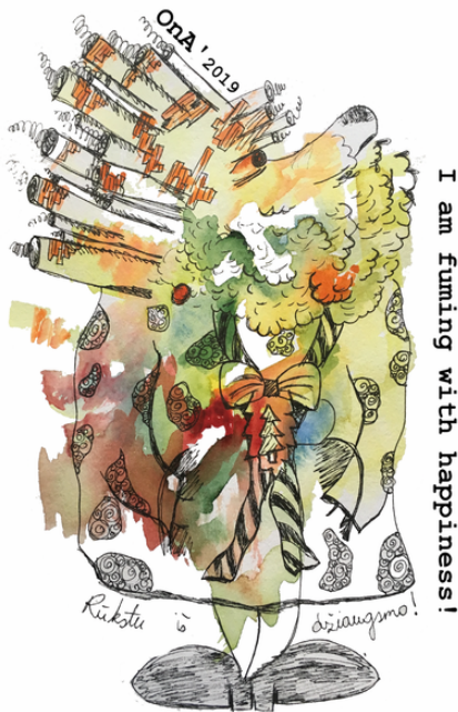
A 2019 watercolor.